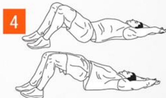
4 10 bridges