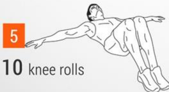
5 10 knee rolls