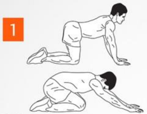
1 10 bottom to heels stretch