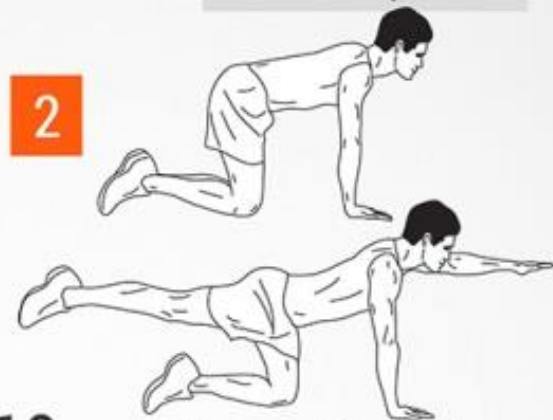
2 10 opposite arm / leg raises